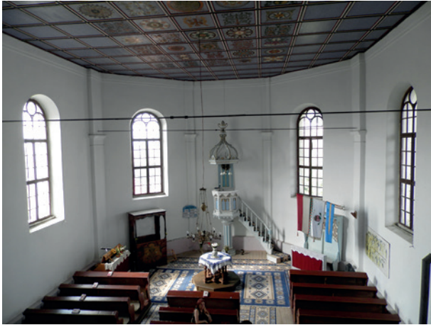
Fig. 9 The Calvinist church of Maksa. (2015)

the main street among the narrow plot strips; thus the orientation was most likely predetermined.