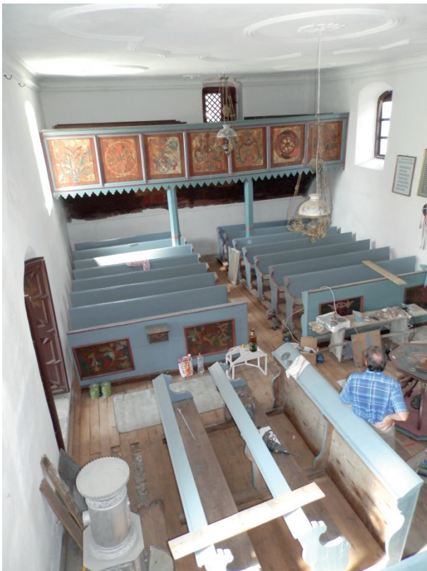
Fig. 10 The Calvinist church of Sepsimagyarós. (The painted furnishing under examination, 2013)

The reason why these late churches reached back to the traditions of church architecture of the middle ages, could be the historicising trend of the time, as well as the connections of the Transylvanian Hungarian Reformed Church with North-eastern Europe: including English, German, Swiss and Dutch relations. The strong stylistic influence flowing in from mostly German and English grounds at the time, as well as the new policy of the German Protestant church architecture, favoured and preferred the Gothic style. The principles of John Ruskin and Auguste Charles Pugin and the effect of the Neogothic