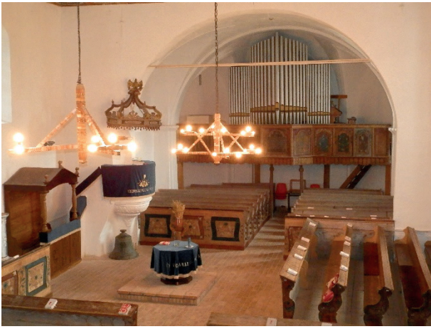
Fig. 7 The Calvinist church of Illyefalva. (2015)