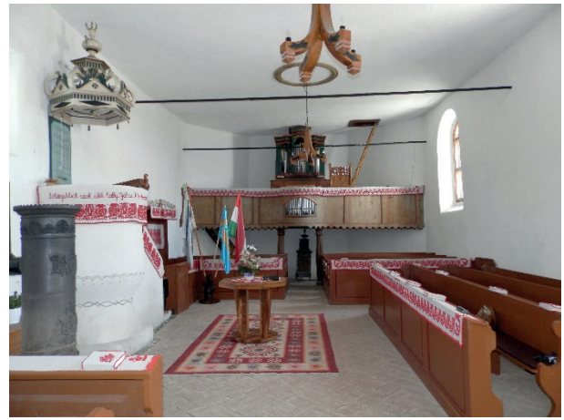
Fig. 6 The Calvinist church of Kálnok. (2015)

proportional number comparing the length and width of the nave is around 3.1 – 3.25. In terms of the cross-section, the height of the inside of the church compared to the nave's width, the ratio is around 0.7 – 0.9. These ratios also show that the mentioned buildings are Gothic churches. 10 (Fig. 5)