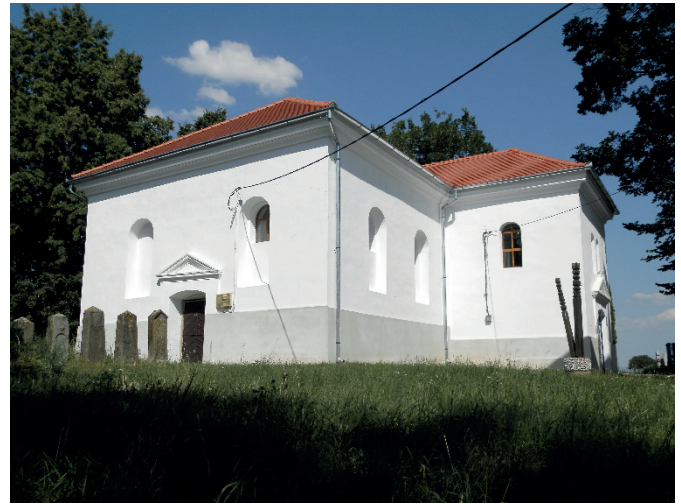
Fig. 4 Calvinist church of Réty. Example for the „T” shaped layout. (2015)