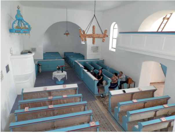
Fig. 3 Calvinist church of Réty. An example of the gallery as an interior shaping element. (2015)