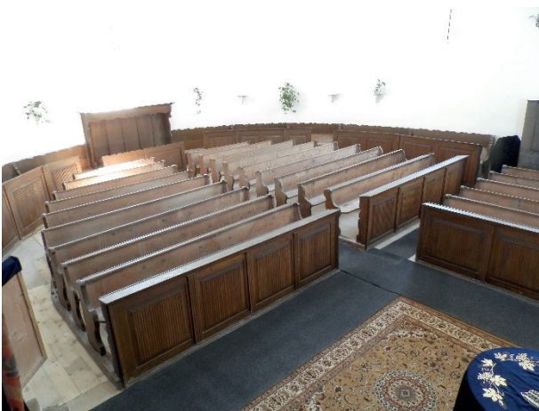
Fig. 8 The Calvinist church of Bikfalva. (2015)

The “Patent of Toleration-type churches” apparently regained a sanctuary or apse in their architecture, which caused some disturbance in the layout of the interior. As seen in the previous Gothic churches, the pulpit is often placed at the triumphal arch or in the traditional place of the altar, in the central axis. The sanctuaries of these churches are mostly vaulted, and although making the interior more diverse, they can be more related to the Roman Catholic church form and interior layout.