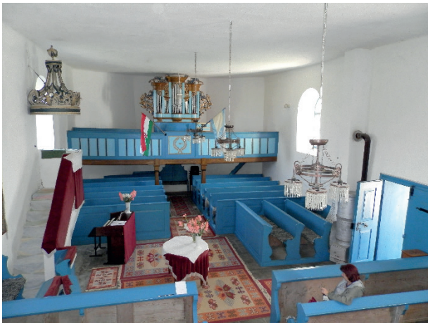
Fig. 1 Calvinist church of Fotosmartonos. An example of the centralising seating order. (2015)

Thus, the reorganisation of the layout played an important role in the rebirth of the reformed church interiors but possibly holding the deepest hierarchical order as well.