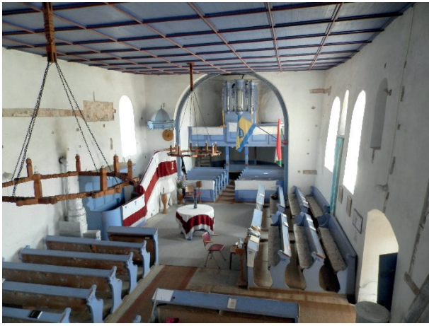
Fig. 5 The Calvinist church of Gidófalva. (2015)