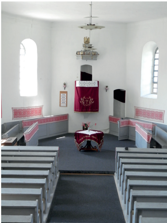
Fig. 2 Calvinist church of Oltszem. An example of the longitudinal seating order. (2015)