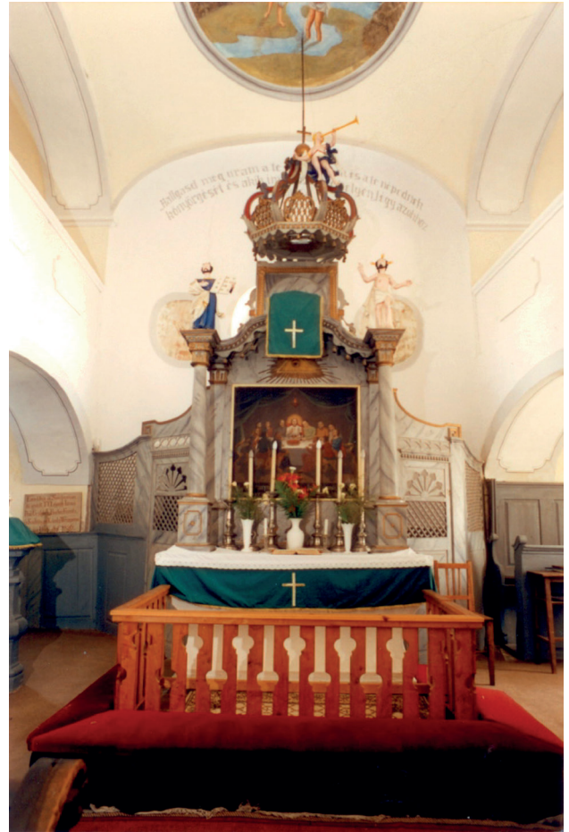
Fig. 9 Kapolcs (Hungary), pulpit altar