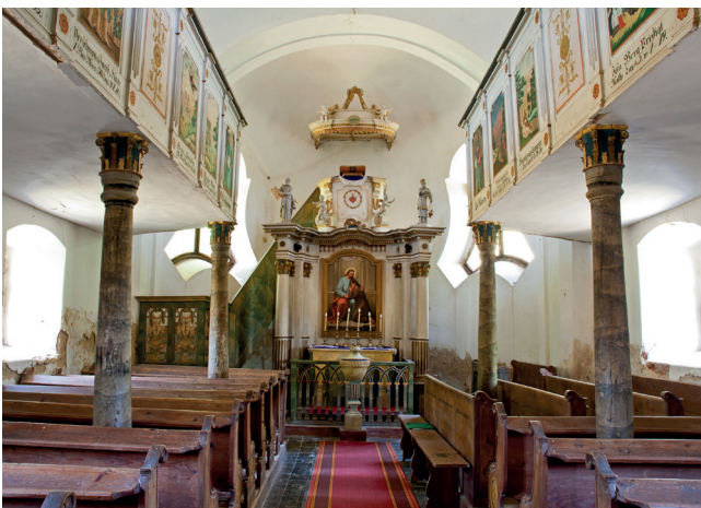
Fig. 5 Murga (Hungary), pulpit altar

The scene-like walled-off space created like this has nothing to do, either historically or content-wise, with the rood-screens of Catholic churches, as the functions of these two are totally different. The wall separating the space, operating in reality as a sacristy, and a store-room discretely hide the stairs leading