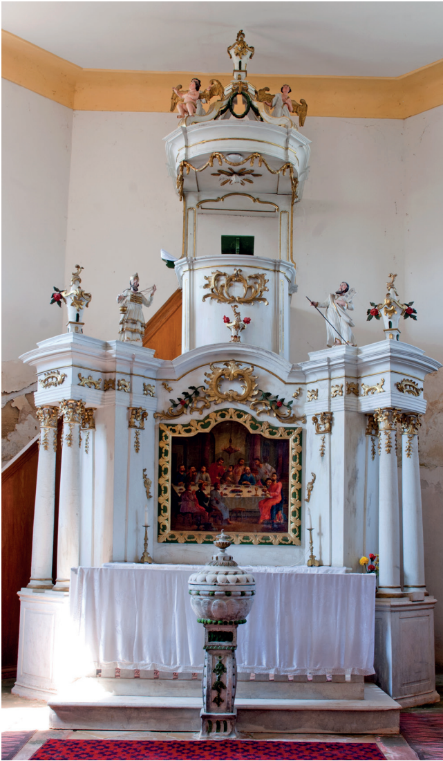
Fig. 4 Felsőnána (Hungary), pulpit altar