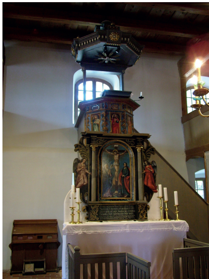
Fig. 1 Nemescsó (Hungary), pulpit altar