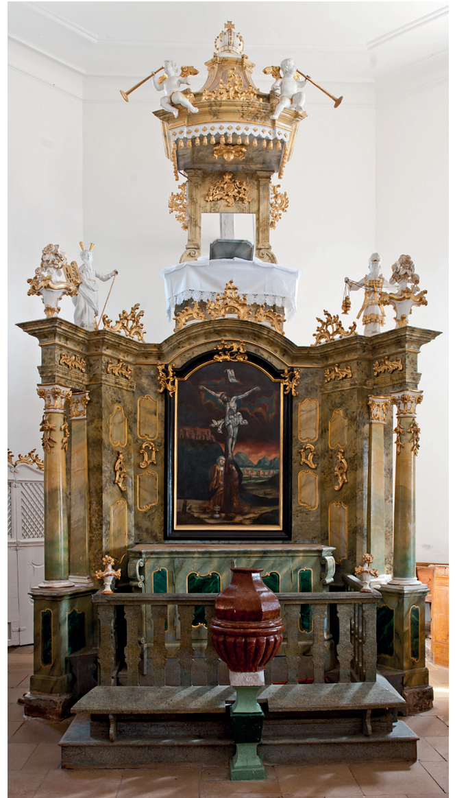
Fig. 6 Sárszentlőrinc (Hungary), pulpit altar