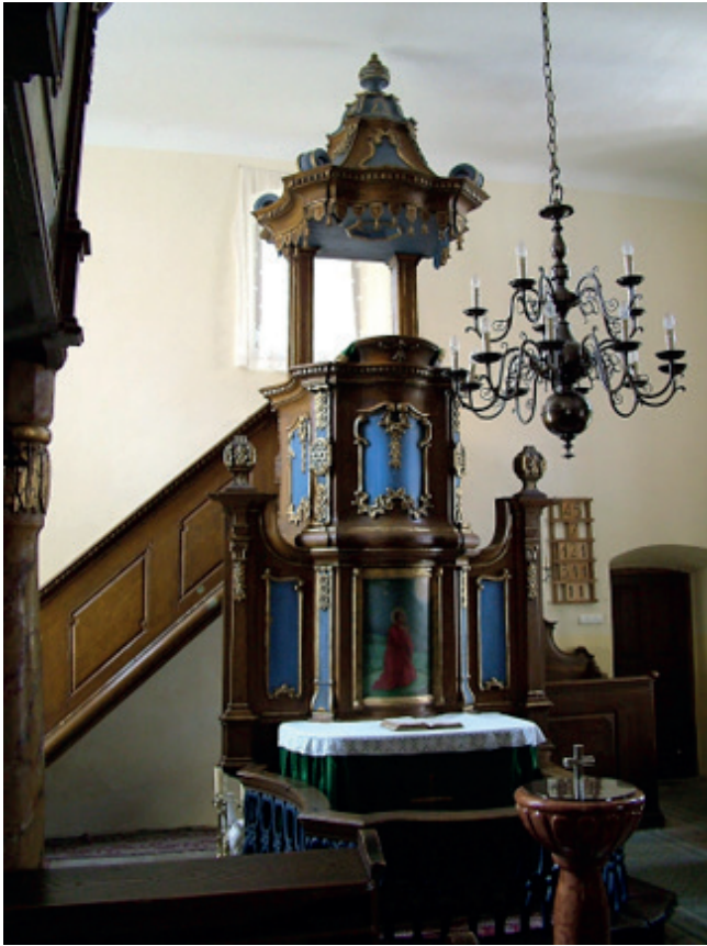
Fig. 7 Bokod (Hungary), pulpit altar