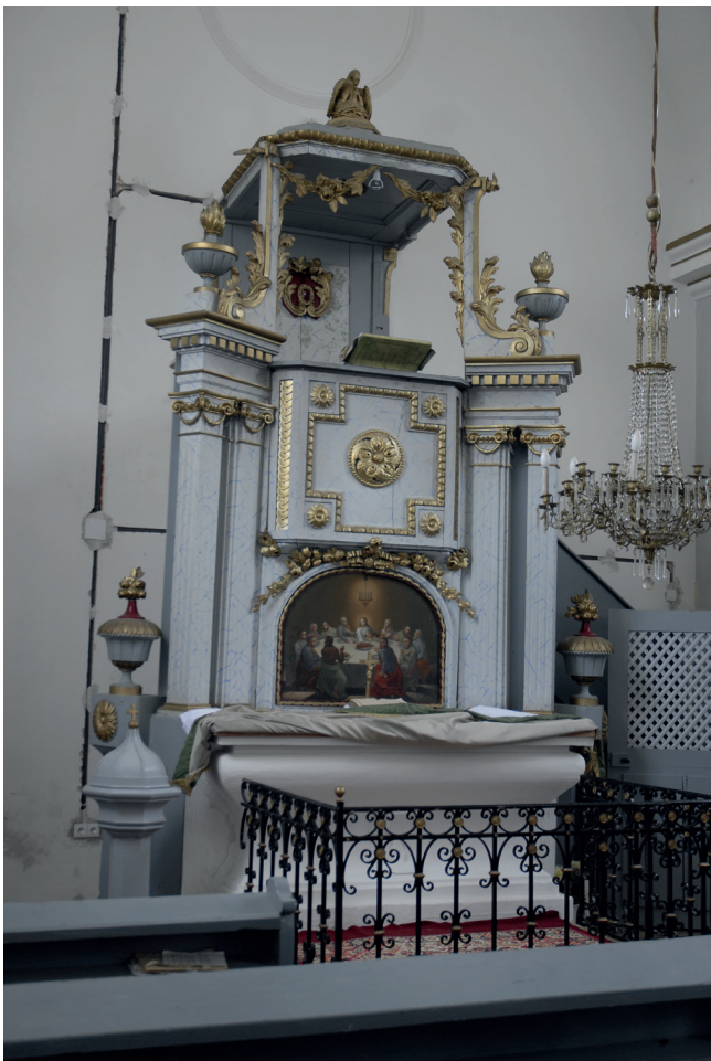
Fig. 8 Tés (Hungary), pulpit altar