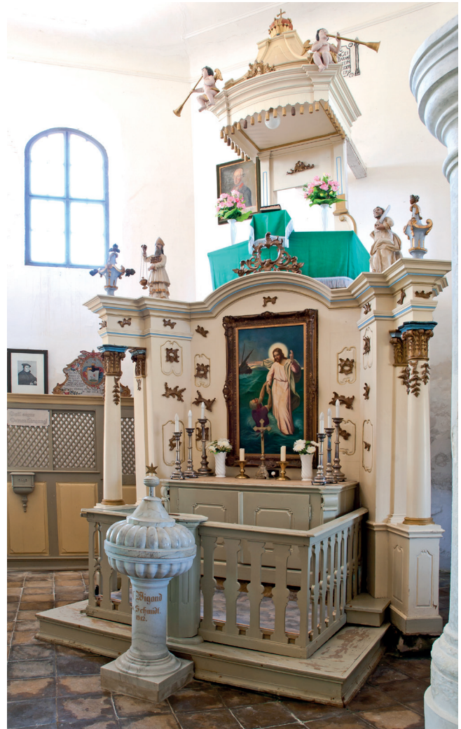
Fig. 3 Varsád (Hungary), pulpit altar

Pulpit altars as individual constructions usually appear as the focal point of the longitudinal nave, as a perfect closure thereof. It is mostly opposite the main entrance, at the end of the galleries where they markedly embody the liturgical requirements demanded from a cult centre. In the case of the pulpit altars of the first group built with an accented retable, the usually large sized altarpiece was always given a dominant role. The accented main cornice above this was typically ornamented with carved vases or sculptures. In the case of this version, the pulpit basket remained hidden behind the altar wall. In most cases, it was connected to the structure with a frame supplied with a special (whispering) door with an ornamented ridge or simply a wall in a matching style, but its ratio within the pulpit altar never exceeded 33%.