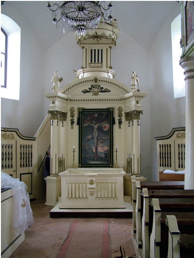
Fig. 2 Keszőhidegkút (Hungary), pulpit altar