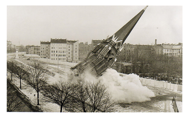
Fig. 4 Radical demolition is a returning issue: detonation of the Versöhnungskirche in Berlin, Germany in 1985

Moore's arguments have many common points with the comprehensive view of design thinking and design culture (WHAT is happening? + WHY is it happening? + HOW to answer/act?). Not only in his views of our world of the 'design capitalism' but also of the radically rethought systems of understanding and reacting to arisen issues. Similarly, it is important to clarify the negative and positive experiences regarding the sustainability of the church and sketch possible positive examples.