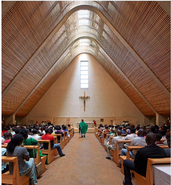
Fig. 7 Room for growth: the Kericho Cathedral in Kenya

Temporary churches can answer the needs of events, festivals, or other temporary uses — from serving as a chapel for construction workers to victims of natural disasters. The awarded Japanese architect, Shigeru Ban built recycled cardboard and paper structures for survivors of major catastrophes. Among his buildings, there are also churches to provide housing not only