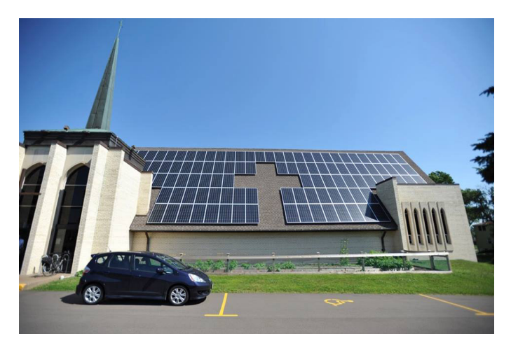
Fig. 1 Sustainability needs more than solar panels neatly arranged on the church roof (St. Christopher's Episcopal Church, Roseville, MN, USA)

For centuries, in Europe and the Western world, Christianity developed to be the state religion. The growing urban centres with increasing populations also meant larger congregations and groups of worshippers who needed bigger church buildings and institutionalised systems to provide adequate religious services. At the same time, accordingly, the income and the sustainability of the institutions was secure.