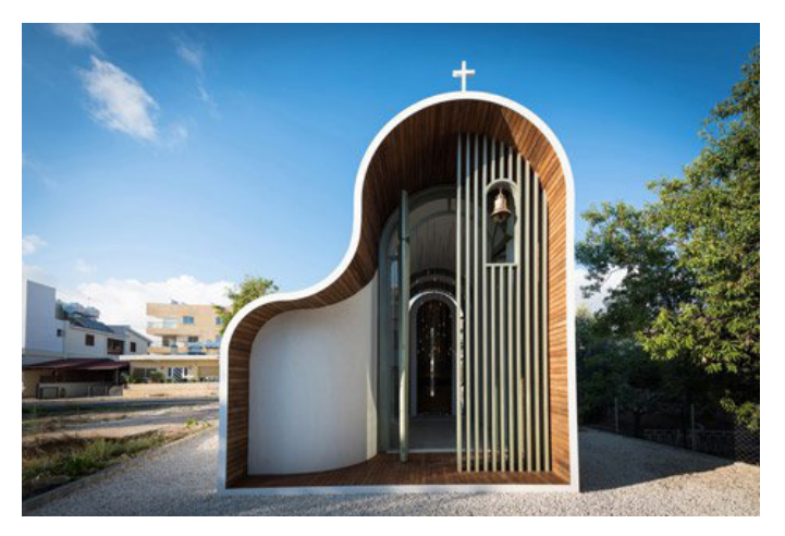
Fig. 5 Enough to serve sustainability: Apostle Peter and St. Helen the Martyr Chapel, Paphos, Cyprus, Michail Georgiou

While for centuries, the cathedrals of growing size prevailed in the northern hemisphere, decreasing congregations represent the biggest challenge, as pointed out by Jákó Fehérváry OSB.<sup>6</sup>