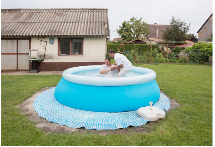
Fig. 10 Ready made baptismal immersion pool in use: Free Christian Congregation of Szigetszentmiklós, Hungary

"It must be understood that the cosmicization of unknown territories is always a consecration; to organize a space is to repeat the paradigmatic work of the gods." (Eliade, 1987, p.32)