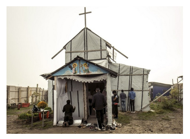
Fig. 9 Spirit matters: St. Michael's Eritrean Christian Orthodox Church in the Jungle at Calais, France