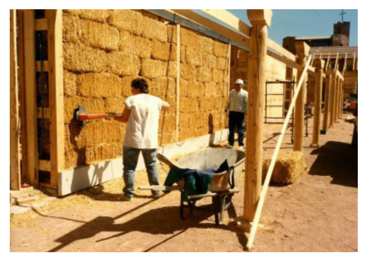
Fig. 2 Sustainability: from construction to everyday life at the Christ in Desert Monastery, Abuquiu, NM, USA

as the medium for, and generator of the architecture" which "responds to and utilizes the living and natural systems that exist on a site that become the »building blocks« of the architecture" (Littman, 2009, p.iii), as well as 'positive impact architecture'. Attia dates the start of regenerative architecture from 2016, connects it to the paradigm of 'Recovery'<sup>3</sup>, and defines 'Positive Impact Building' as a natural state of the regenerative sustainable building seeking "the highest efficiency in the management of combined resources and a maximum generation of renewable resources." (Attia, 2016, p.397)