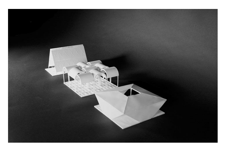
Fig. 8 Room for spiritual life for those living in refugee camps and wishing to practice their faith

for the body but for the tormented soul. Ban has called to life the Voluntary Architects' Network, a movement to aid those in need.