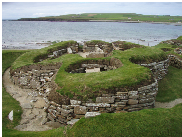
Fig. 1. The Neolithic village of Skara Brae (Orkney Island, Scotland)

construction had developed and changed dramatically over a relatively short period. New building materials emerged (cast-iron, glass structures, concrete, steel) and structural systems were planned not in empirical ways but on calculative methods [6, 7].