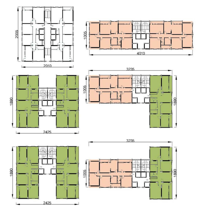
Fig. 1 Floor plans of the studied models

Also, by increasing the number of floors for each form, nine different height models were obtained. When the number of floors is increased with tunnel form systems, it is ensured that there are no significant differences regarding architecture and statics. The shear wall elements are modelled according to minimum conditions, and their thicknesses are increased by making interventions where they