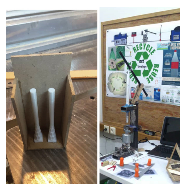
Fig. 6 The developed design interventions for sustainability during the experiment: Urban Recycling Tool

7 Designed by: AUI industrial design student, Zahra Torki