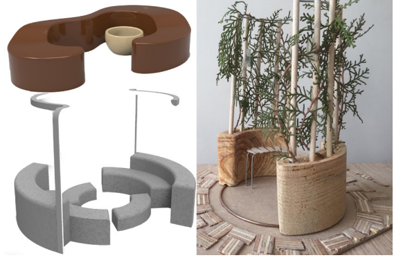
Fig. 3 The developed design interventions for sustainability during the experiment: Modular eco street furniture