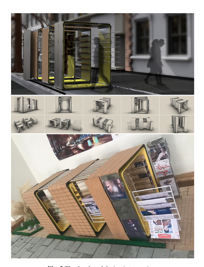
Fig. 2 The developed design interventions for sustainability during the experiment: Flexible modular kiosk