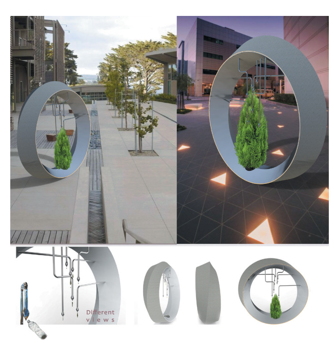
Fig. 5 The developed design interventions for sustainability during the experiment: Holy Circle, an eco-aware drinking fountain

recreated to make an urban pot combined with a drinking fountain. Form of the pot reminds an element of ancient Persia which mythically protected the mankind and the nature. Wasted water from the fountain irrigates the plant underneath the fountain and gives a massage on the need for more careful water consumption. By giving value to the plant and water, the pot aims to sensate the public on environmental issues (see Fig. 5).