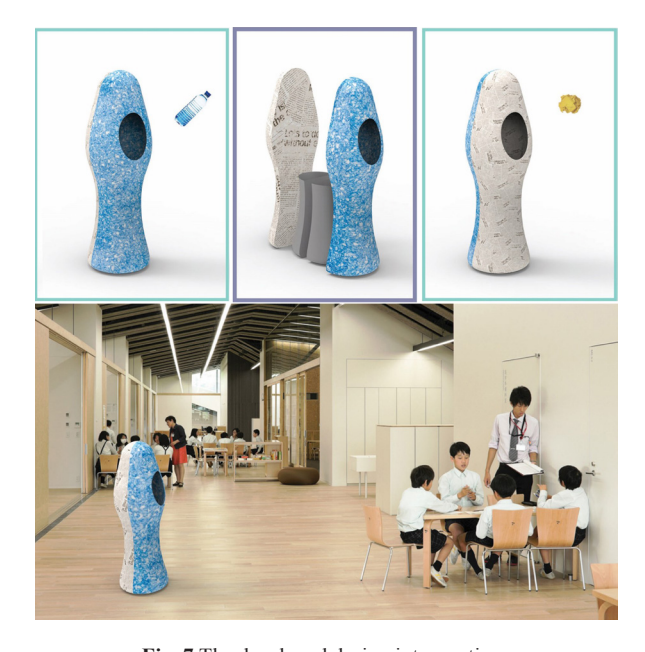
Fig. 7 The developed design interventions for sustainability during the experiment: Spirit of Waste