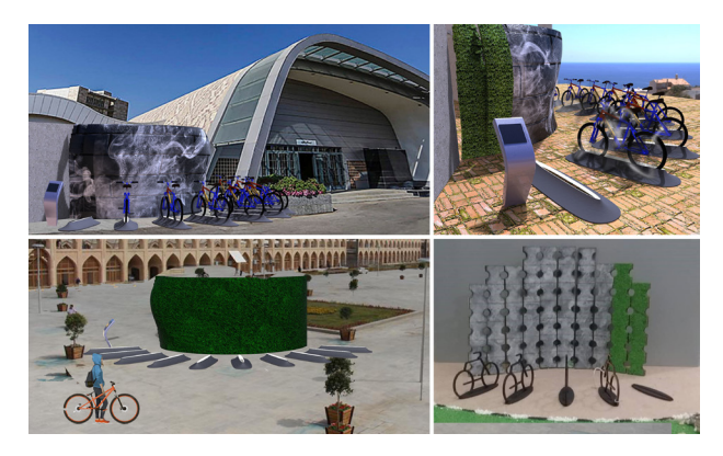
Fig. 8 The developed design interventions for sustainability during the experiment: Green Air Bicycle Station

smokers and highlight the link between the cigarette butt they drop on the street or down the drain and the impact it has on the environment. It contains a displaying surface which counts the number of every added butt in the bin and shows a massage of its impacts on fishes and the environment. The interactive bin also can be used for citizen voting, football match polling and can include other persuasive interactions in order to attract smokers to throw their cigarette butt in the bin. The aim of this project is to design an interactive bin for the urban environment to limit the cigarette butts littering behavior in an engaging and effective way (see Fig. 9).