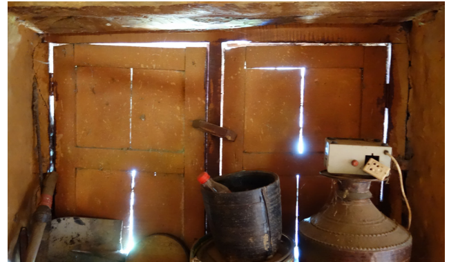
Fig. 6 Spacing between window frame, wall and operable window area