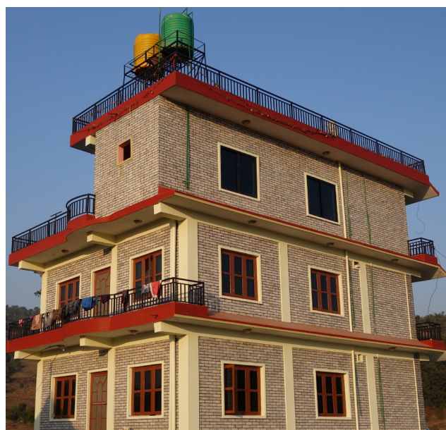
Fig. 2 Typical BMC type building at Pokhara

The airtightness measurements have been done with a Blower door test system, which can pressurise or depressurise a building (Sherman and Chan, 2004). The envelope airtightness test was performed using the blower door fan pressurisation method according to ISO 9972:2015 (ISO, 2015).