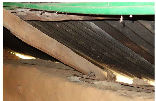
Fig. 8 Gap in the pitched roof and wall joint area

type buildings, a leakage path was identified as the spacing between the window frame and window. Horizontal window sliders in aluminium framed