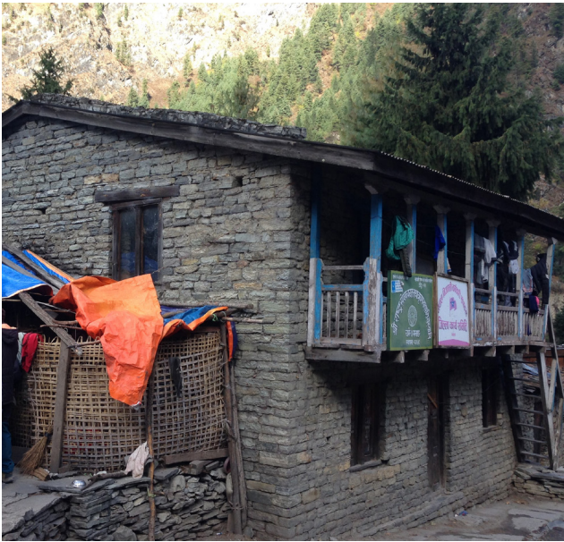
Fig. 3 Typical SMM type building at Chame, Manang