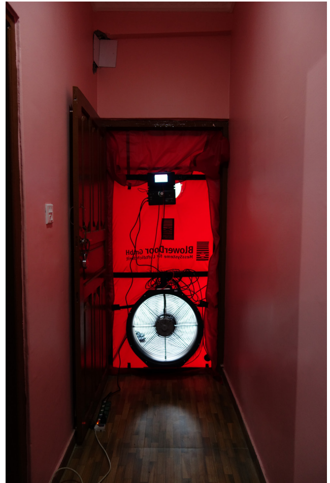
Fig. 5 Blower door test setup in an actual airtightness test

The dimensions of the buildings were measured. The blower door test system was mounted on one of the exterior doors. All enclosed intentional openings such as exterior doors, windows and ventilation holes were closed. The blower door fan was connected to the DG-1000 manometer and was wirelessly controlled via the TEC AUTO TEST application. To further comply with the technical standard ISO 9972:2015 (ISO, 2015), indoor and outdoor temperature measurement was read through a calibrated temperature sensor and was duly input in test readings. The test setup included 10 points with flow measurements