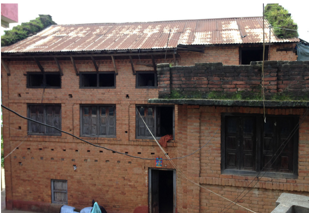
Fig. 4 Typical BMM type building at Dhulikhel

The airtightness test was performed using a calibrated standard Model 4 Minneapolis blower door test setup with DG-1000 pressure and flow gauge with an accuracy of \pm 0.4\% (TEC, 2017) produced and distributed by The Energy Conservatory (TEC).