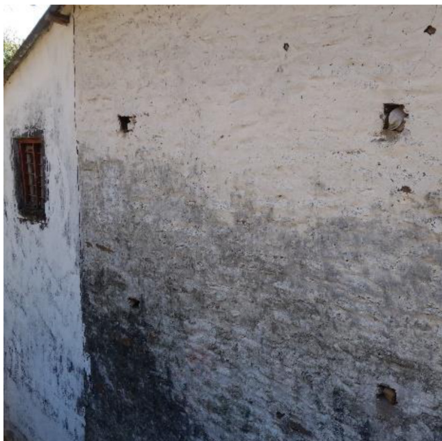
Fig. 9 Holes in the wall surface

windows also aid the airflow in and out of the BMC type building.