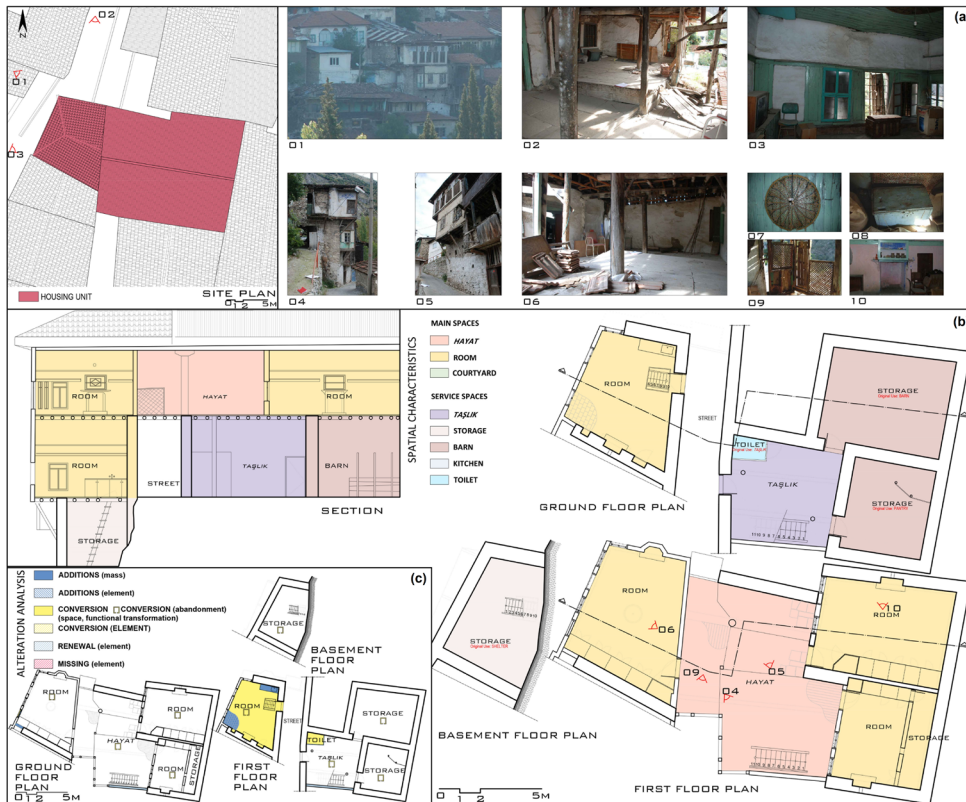
Fig. S2 (a) Site plan and photos, (b) spatial analysis, (c) alteration analysis of current of house numbered 13