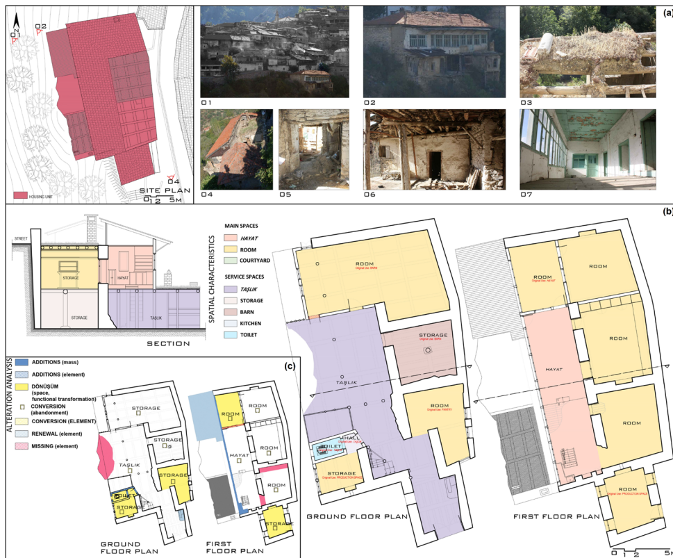
Fig. S5 (a) Site plan and photos, (b) spatial analysis, (c) alteration analysis of current of house numbered 43