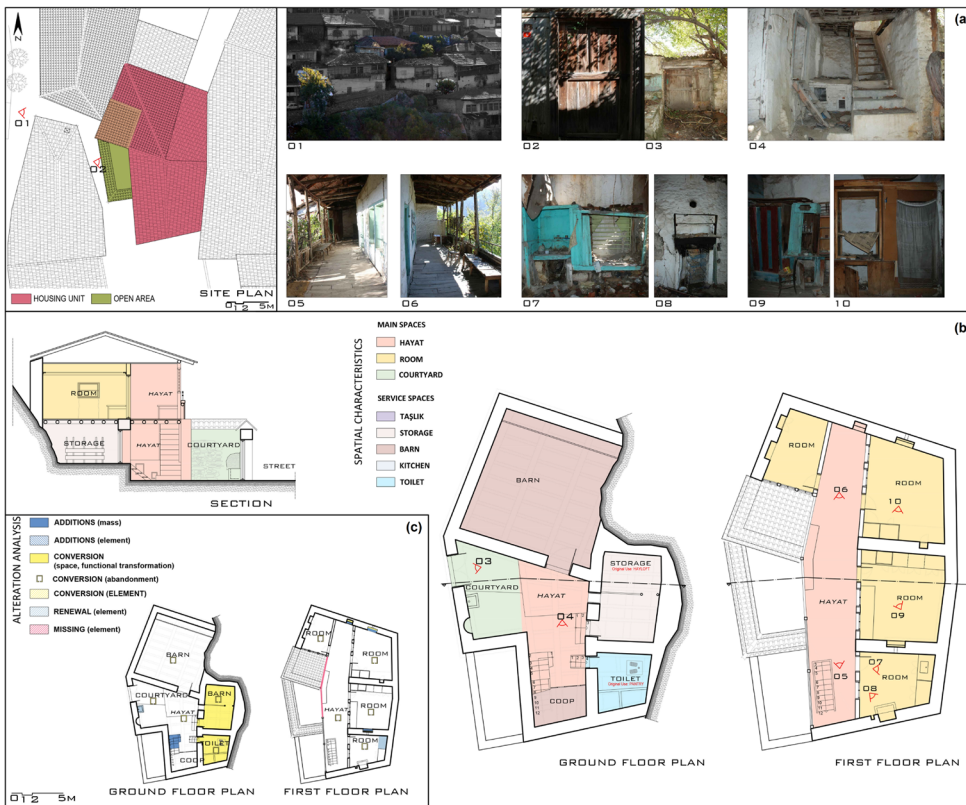
Fig. S3 (a) Site plan and photos, (b) spatial analysis, (c) alteration analysis of current of house numbered 45