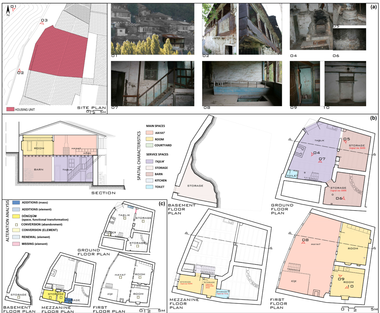
Fig. S1 (a) Site plan and photos, (b) spatial analysis, (c) alteration analysis of current of house number 8

* Corresponding author, e-mail: aysenetlacakus@iyte.edu.tr