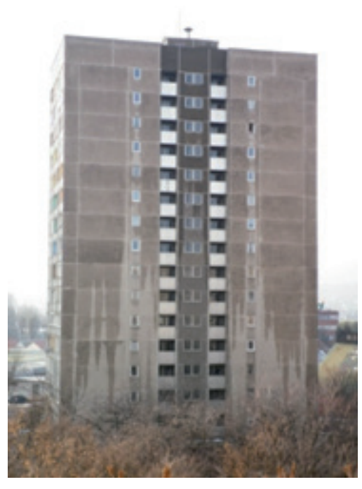
Fig. 7. Block of flats in Kelenföld (moisture can be seen on a large area, covering entire panels of the building).

Compression causes an increase in the material's density, as a consequence of this, the thermal conductivity factor changes. This effect is widespread with fibrous thermal insulation materials; figure 8 shows the thermal conductivity factor of glass wool as a function of density [9, p. 104].