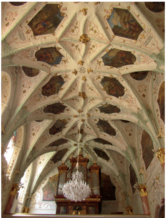
Fig. 3. The vault of the church in Máriavölgy (Marianka)

The assumption is that the church in Márianosztra is not the only Pauline church with Gothicized elements: the church of the Pauline monastery in Máriavölgy (in Slovak: Marianka) could also have mainly been built in the Baroque period. The purist reconstruction of the sanctuary around 1870 makes its evaluation difficult, but the nave still shows its form from the 18th century. The nave copies the spatial arrangement of the Jesuit Church of Nagyszombat (in Slovak: Trnava) – although this is designed with lancet windows – and is covered with a barrel-like vault with lunettes, on the surface of which the world of Gothic rib vaults is imitated by stucco braids started