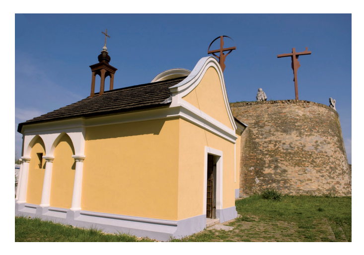
Fig 4. The chapel of the Holy Sepulchre in Győr