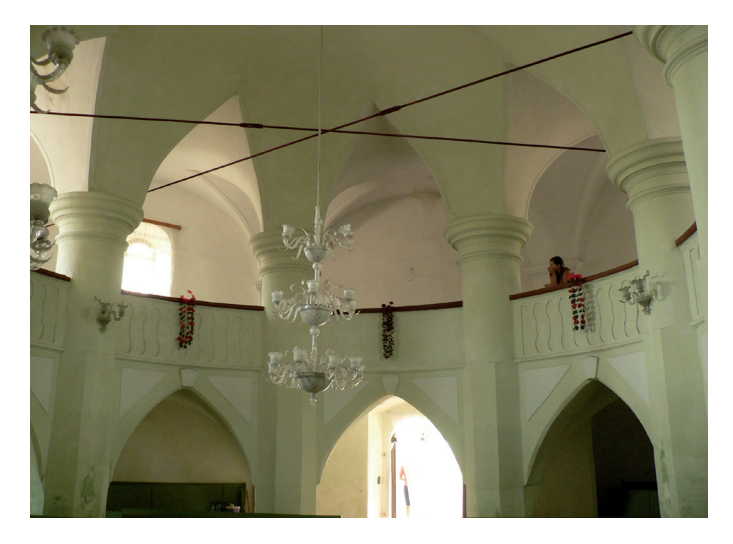
Fig. 2. The interior of the church in Malomárka (Monariu)

frescoes were replaced by new ones (which were removed from the walls in 1937), and new lancet openings were placed into the end walls. [4, pp. 168-171]