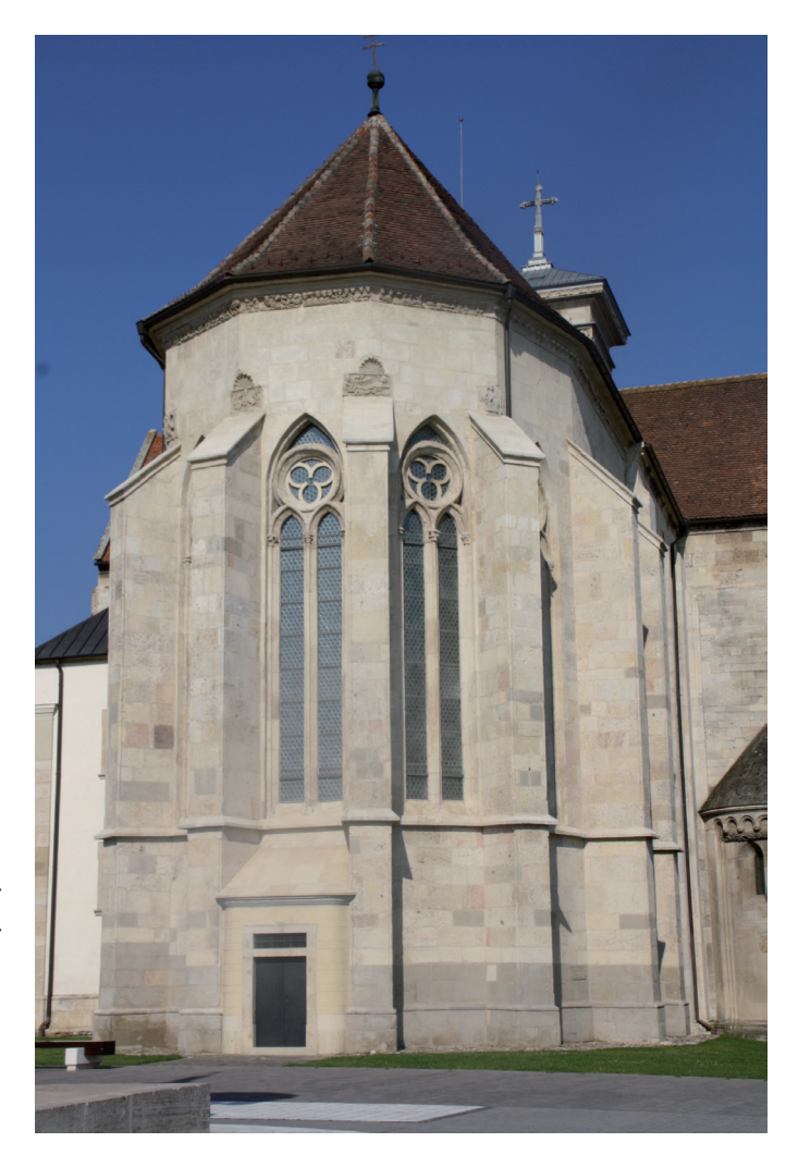
Fig. 1. The sanctuary of the Cathedral of Gyulafehérvár (Alba Iulia)

Examples can be presented not only from Transylvania. The Inner City Parish Church in Pest was reconstructed in phases