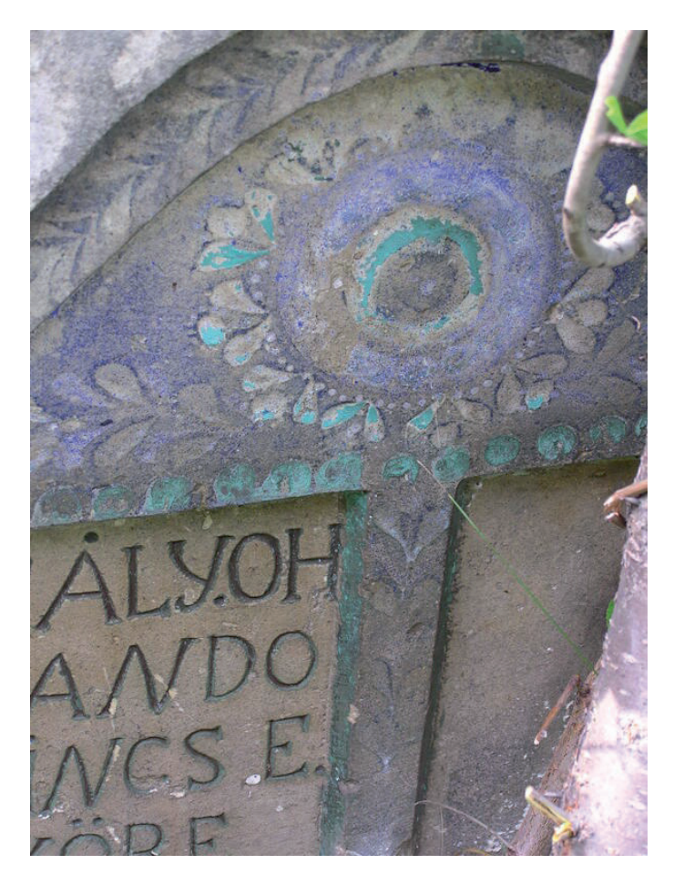
Fig. 8. Detail of a painted gravestone in the cemetery

The bell, which was cast during the reign of King Matthias in 1482, originally hung in a separate bell tower [1, p. 299]. The construction of the tower standing now began in 1799 under the direction of the master builder József Léder, who gained a reputation as one of the most important proponents of neoclassical architecture in Kolozsvár (Cluj). The organ was made in Nagyvárad in 1826. In the same year, a carpenter from Kolozsvár, József Pesthi, constructed the gallery on the eastern side; the organ was situated here until it was moved to its current position in 1896 [7]. The carved wooden gates of the churchyard that can be seen today were inscribed with the year they were made, 1935, when the gates that had stood there since 1848 were replaced.<sup>7</sup>