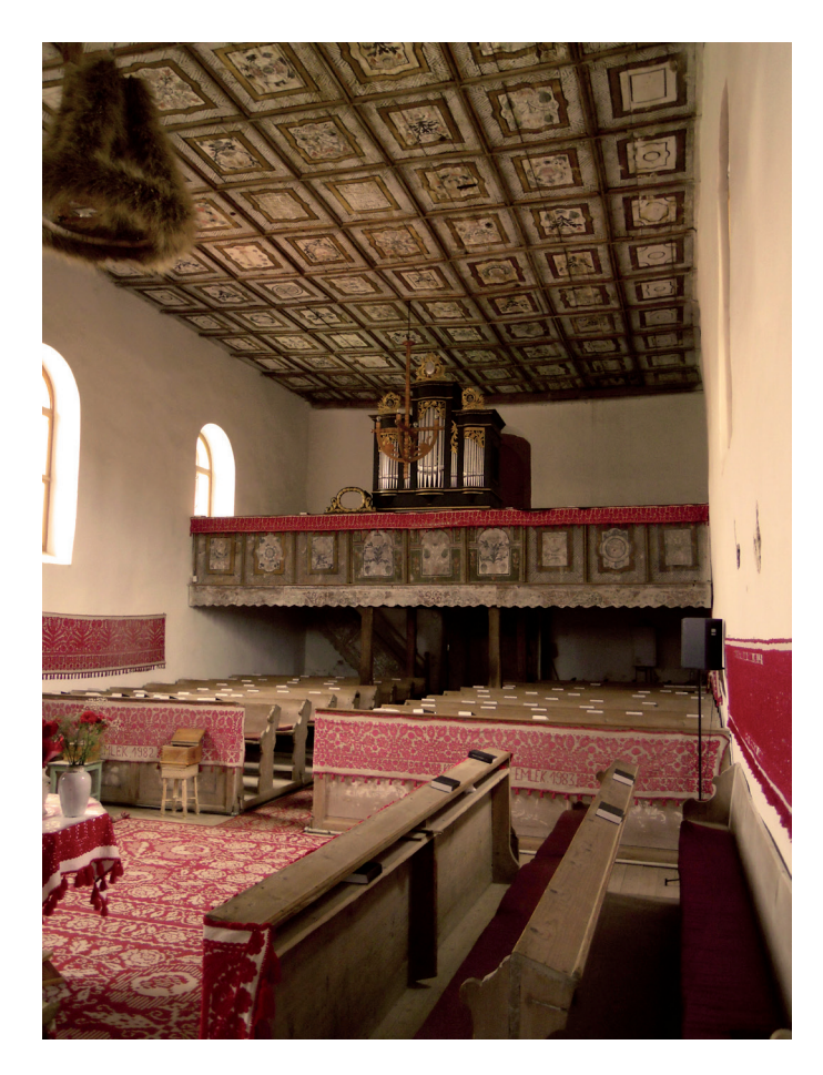
Fig. 6. The inner view with the western gallery