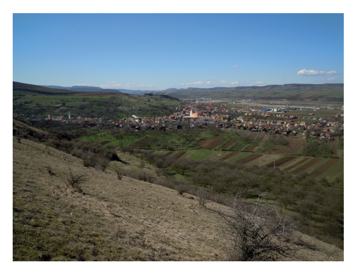
Fig. 1. Magyarlóna the Transylvanian village