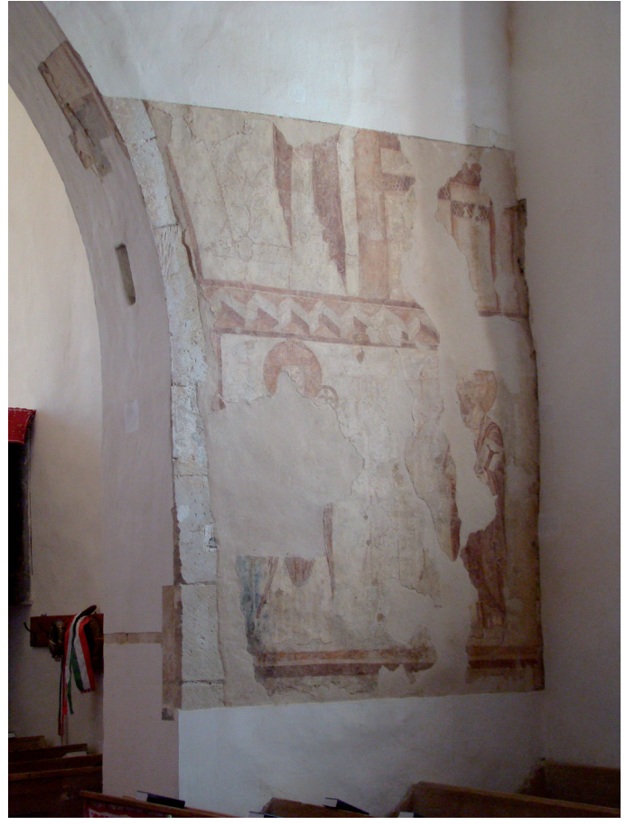
Fig. 4. The fresco with two unidentifiable figures - bishops or evangelists

1652, before becoming Magyarlóna around 1910. In Romanian, it used to be called Lona and then Lona Săsească before acquiring its present name Luna de Sus, meaning the moon above, at the end of the 1920s. Like most villages in Transylvania, it also had a German name, Sächsischlone or Deutschdorf. The