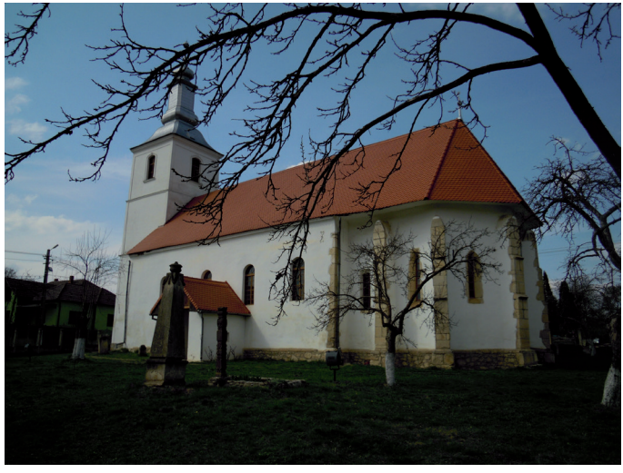
Fig. 2. The South-East view of the church