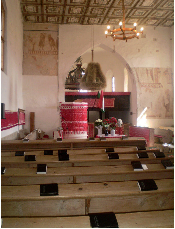
Fig. 7. The inner view of the church with the frescoes

Mongol invasion. In world terms, religious freedom was first proclaimed in Transylvania at the Diet of Torda in 1568; this ordered that no one could be persecuted for their religious views. The sweeping change ushered in an important period in the church's architectural history, and in 1601, the Reformed rectory was built.