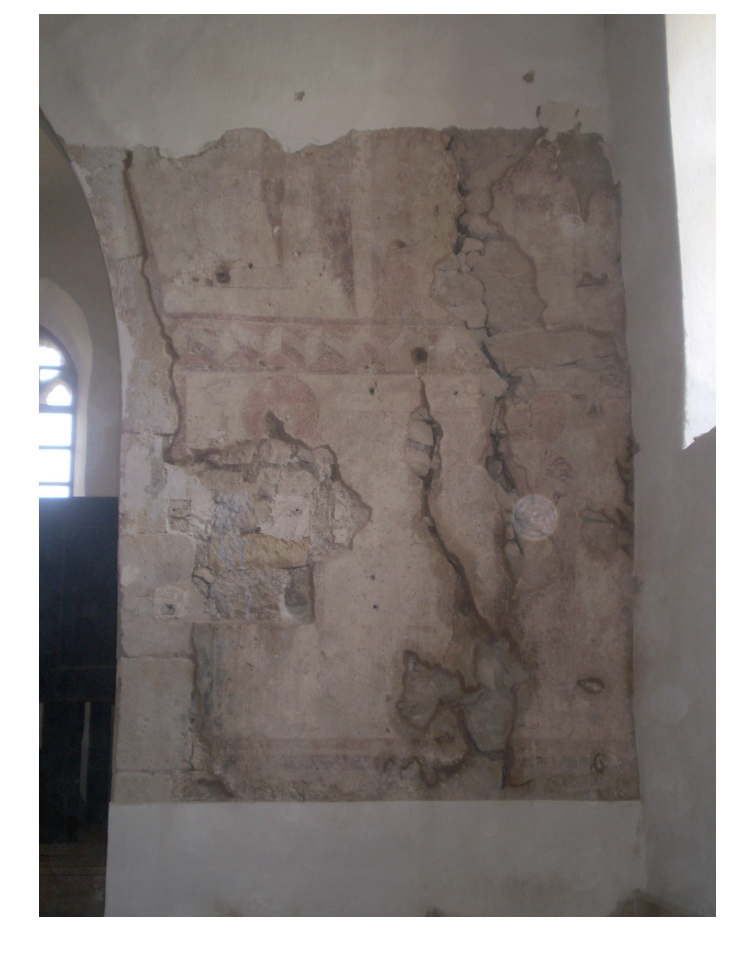
Fig. 3. The frescoes as the restorer found them under the plaster