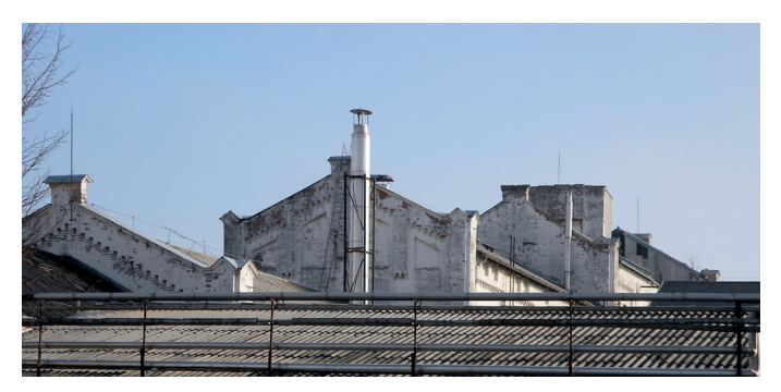
Fig. 2. The factory of "Első Óbudai Szeszégető és Finomító Részvénytársulat" in Óbuda, built in 1867.

The industrialisation and urbanisation changed the city's economic, social, physical and natural context over just a few decades. The distances, growing population and lifestyle had new needs for mobility, living and activities. Consequently, public transport became indispensable. The first horse tramway started to function along Váci út, parallel to the Danube, in 1866; the suburban railway transport, the HEV was created in 1887. Most of the lines follow the river, North Buda (HÉV Szentendre), South Pest (HÉV Csepel, Ráckeve) and South Buda (HÉV