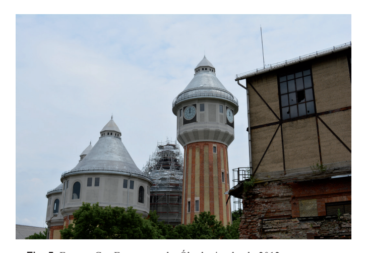
Fig. 5. Former Gas Factory on the Óbuda riverbank, 2012.

The question arose as to what kind of process would help the renewal of the abandoned brownfield sites? In the Budapest 2030 Long-Term Urban Development Concept that was published in 2013, the problem of brownfield sites is among the most significant topics. Following this strategic document, the municipality of the capital launched three thematic development programmes - the renewal of brownfield sites, the development of the Danube riverbank and social housing - searching