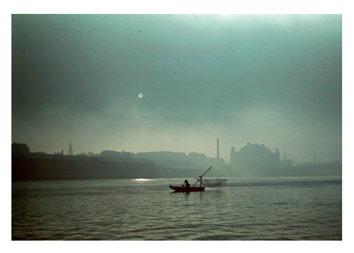
Fig. 3. Danube and industry, Budapest, 1940.

established new institutions, and Budafok became the area for beer, wine and champagne production. The most important factories also had a direct railway connection. It was reasonable to divide goods transportation and passenger traffic using the same railway lines; however, in several cases transfer and passenger stations functioned separately. In Pest, the Lipótváros transfer station served the northern industrial area, the Ferencváros and Duna stations, the southern part of the city. (Fig. 3)