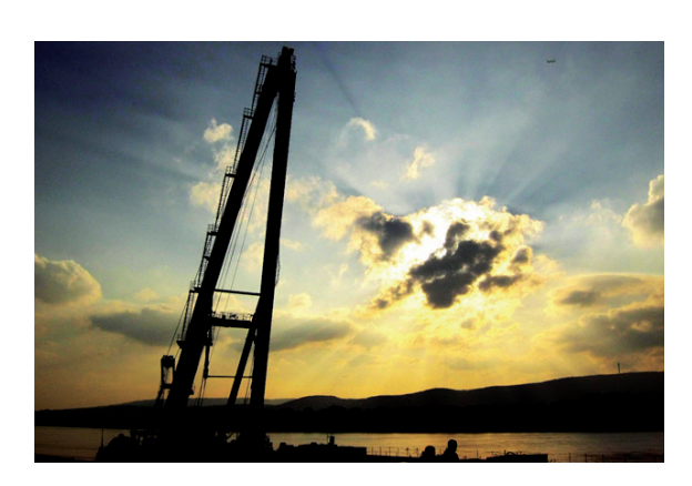
Fig. 4. Nature and industry, Budapest, Népsziget 2014.

56 Period. Polytech. Arch. Márton Garay / Melinda Benkő