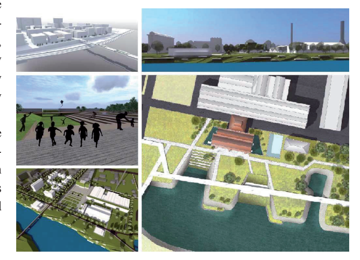
Fig. 6. Visions for future – changing the function of the areas nearby the Danube

former values have disappeared, and sites are neglected. The economic crisis in 2008 halted grandeoise project ideas and the area has slept. Meanwhile, this status has provided the opportunity for new developments that can be guided in a more context-sensitive and sustainable direction. Temporary or definitive urban and architectural solutions are needed to create and improve the river environment's attraction, to remember the historic identity, enforce the tools of green mobility, and for the first time in this story, integrate the entire Danube zone into the everyday life of Budapest.