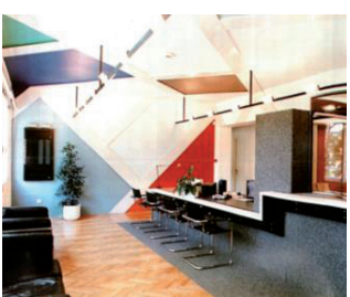
Fig. 4-5 The interior of Theo van Doesburg and its remake in the villa renovated by Tamás Dévényi. (http://upload.wikimedia.org/wikipedia/commons/e/e6/Cin%C3%A9-dancing_Strasbourg_-_Theo_van_Doesburg060611_006.jpg, retrieved on 24th April 2014, and Dévényi 1994:p.344).

Primer modernist forms appearing on new buildings represent a basic level of evocation. For example, the radical shape of the plan for a skyscraper on Friedrichstraße by Mies van der Rohe stands as a model to the sharp disposition of Alkotás Point Office Building by Építész Stúdió (Szentpéteri, 2002a).