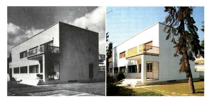
Fig. 1-2 The villa designed by Gyula Rimanóczy. (Ferkai, 1995:p.135) and renovated by Tamás Dévényi. (Dévényi, 1994:p.349)

The first example of modernist resuscitation in the 1990s is a result of a design relatively contingent in historical terms. In 1994, Tamás Dévényi converted a private villa designed in the 1930s into a bank office and a flat. The estate stands in Pasarét, one of the most up-market areas in the Buda quarter, within Budapest.<sup>3</sup> The house has been circumspectly restored to a level of historical preservation. (Ferkai, 1995:pp.134-135). In this design, pre-war modern architecture as a tradition manifested itself for the first time.