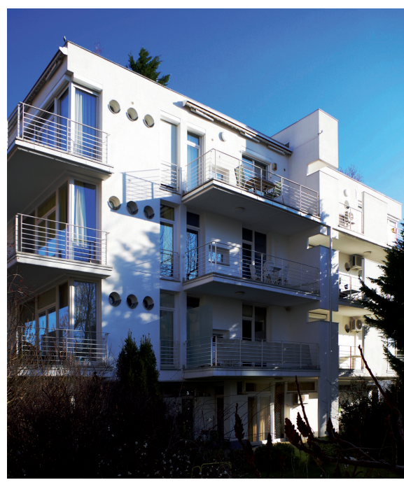
Fig. 3 The residential community of Beregszászi út.

The renovation of a villa, the topographical study and the conference became inevitable preliminaries to following designs. After unpublished and thus isolated examples<sup>5</sup>, the first new building applying modernist forms was the apartment building in Beregszászi út, Budapest by György Vadász, Miklós Miltenberger-Miltényi and László Váncza in 1997. The authors created the first emblematic work of the newly modern, but they were not the first to rediscover modernism in Hungary.<sup>6</sup>