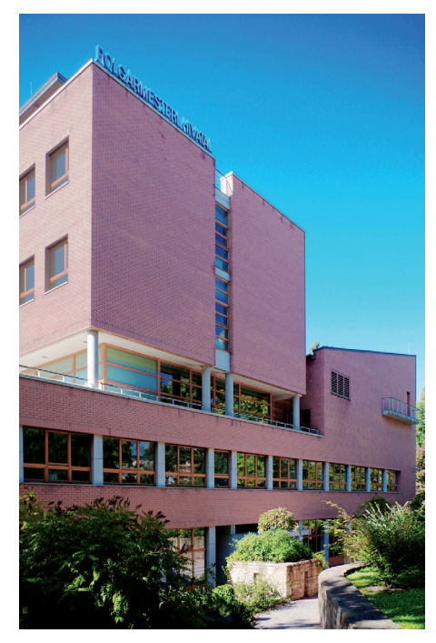
Fig. 9 The Council of Angyalföld District, Budapest.

The characteristics of the 'other modern' also appear beside the International Style. <sup>12</sup> Critics admire the work of János Kóris for following the original intentions in the extension of the council building, that is, the design principles of the Amsterdam School (Szegő, 2002).