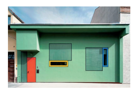
Fig. 16 Family house in Óbuda by Tamás Tomay from 2014.

Two paths of departure seemed feasible. Critiques on some later works from 2005-2006 point out the role of individual interpretation and sees these works as virtuoso reinterpretations of the Modern Movement (Farsang, 2008; Martinkó, 2009). Fragmentation of the trend becomes obvious as the role of personal tone increases since it is a common process at the end of stylistic periods and is often referred to as mannerism. The second possibility is the submerging of the modern ideas after their spectacular parade. Newly modern architecture has already been described as part of the Third Path Architecture in Hungary by Rudolf Klein in 2001, besides high-tech and organic. This ever-popular and fairly positive denotation in Hungary was a collective term applied to trends such as conceptualism, regionalism and minimalism, and these thriving trends all share the remote legacy of the Modern Movement (Klein et al., 2001:pp.39-49).