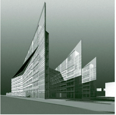
Fig. 6-7 Plan for a skyscraper in Friedrichstraße by Mies van der Rohe and the Alkotás Point Office.

Another scheme, followed by many architects was an implementation of a perfectly circumscribable modernist toolkit. Márton Szentpéteri names tube railing, strip windows, pergola and large surfaces without windows as standardized elements of the new Bauhaus style (Szentpéteri, 2002b), and in the words of József Martinkó (Martinkó, 2002) we might as well add whitewashed walls, projecting slabs and circular windows. All houses published under various terms earn their reputation by applying a discretional number of the above elements.