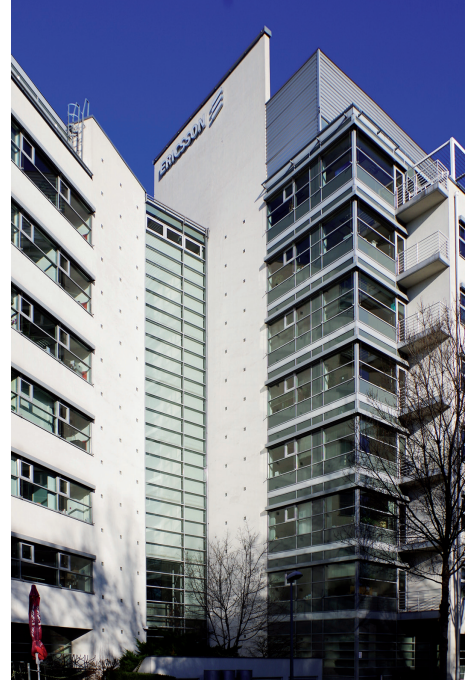
Fig. 8 Építész Stúdió: Skanska Office.

Another scheme, followed by many architects was an implementation of a perfectly circumscribable modernist toolkit. Márton Szentpéteri names tube railing, strip windows, pergola and large surfaces without windows as standardized elements of the new Bauhaus style (Szentpéteri, 2002b), and in the words of József Martinkó (Martinkó, 2002) we might as well add whitewashed walls, projecting slabs and circular windows. All houses published under various terms earn their reputation by applying a discretional number of the above elements.