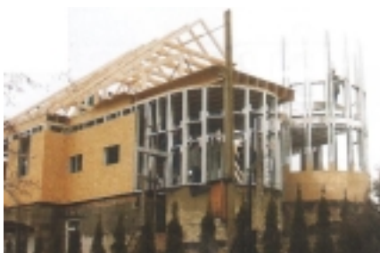
Fig. 1. Protektor profile house

Figs. 1 and 2 show steel framed living houses during the building process. The structural characteristics are visible in the pictures.