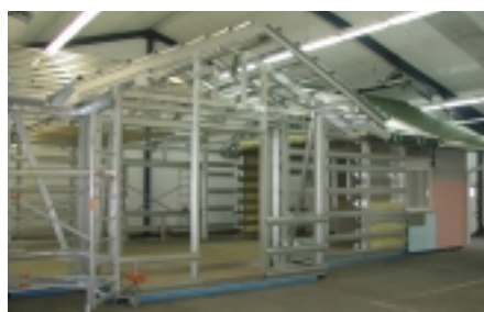
Fig. 2. Lindab Familyline building