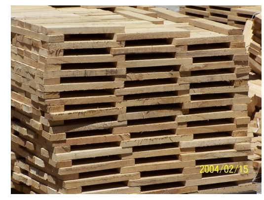
(c) Drying the cut wood in the open air