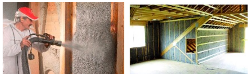
Fig. 7. Application of boron added cellulosic insulation material [50].