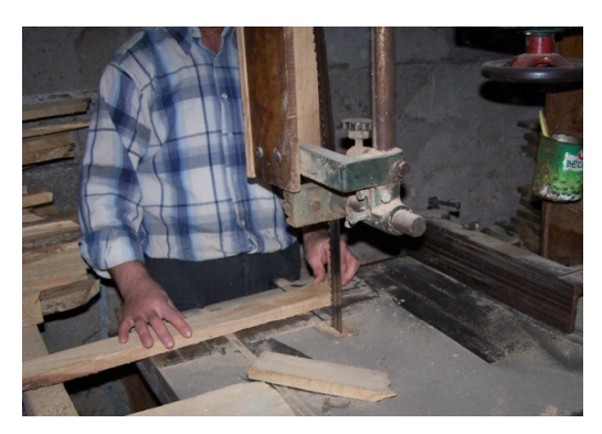
(a) Processing wood with electrical machines