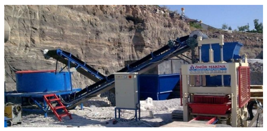
Fig. 4. Manufacture of pumice block with pumice block production machine in pumice resource [43].