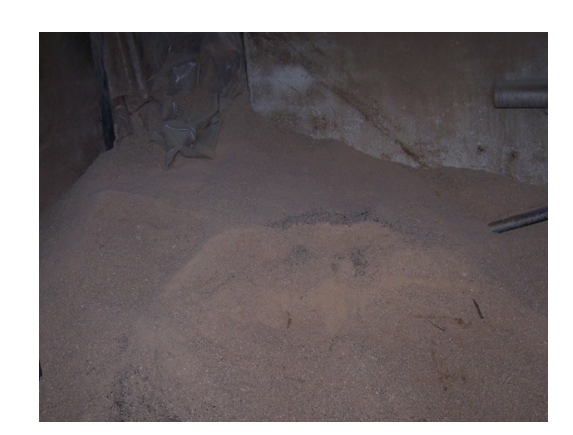
(b) Shavings that come after the cut of wood and is used in furnaces as fuel