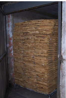
(d) Drying the wood in furnace to decrease the humid level of the wood dried in the open air