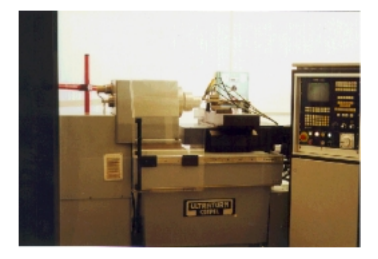
Fig. 1. The ULTRATURN UP1 high precision lathe

of the machine construction work (e.g.: rigidity, accuracy, tool materials, etc.) [3]. The preparation for the grinding experiments, which was started last year, has been finished. In the last year we obtained a high accuracy and revolution spindle with the appropriate supplying equipment (air filter set, electrical equipment, water chiller). The plans of the spindle setting up fixture were accomplished and carried out. The other side of the work was the preparation for the analysis of the future grinding experiments, which necessitated the construction of a measuring station capable for measuring the cutting parameters (cutting forces, vibration, acoustic emission). The measuring equipment has also been carried out.