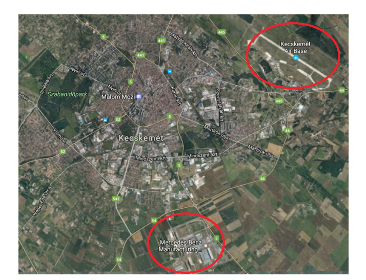
Fig. 2 The geographical position of the Mercedes factory and the airport (own edition based on Google Earth)

The situation of Kecskemét is very similar to Győr, but it is even more advantageous in some respects. While in Győr only one German enterprise is present, there are three operating multinational companies in Kecskemét, namely, the Mercedes - Benz Manufacturing Hungary, the Knorr - Bremse Fékrendszerek Kft and Siemens. The continuously increasing traffic of Győr-Pér Airport as well as the recent improvements and investments all prove that - in addition to Budapest Ferenc Liszt International Airport - there is a need for smaller airports in our country to serve international air transport. Similarly to the example of Győr Airport, the multinational companies operating in Kecskemét would receive a considerable role in opening the base to the civilian traffic. All of the aforementioned three companies are located within the administrative boundaries of the city; Mercedes factory is the furthest away with 7 km which can be seen in Fig. 2.