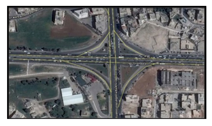
Fig. 2 Aerial Photo of the Selected Intersection

Fig. 2 shows an aerial photo of the selected intersection: Tabarbour, Tabarbour intersection is located in Amman, the capital city of Jordan. The intersection is controlled by a pretimed traffic signal with a cycle length of 155 seconds. It is considered one the most significant intersections in Amman. The intersection connects the major arterial road: Al Shaheed, with the minor arterial roads: Prince Hamza and Tareq. Al Shaheed road runs East and West bounds of the intersection. It is a four lane divided arterial road with a posted speed of 70 km/hr. It connects Zaraqa city, the second largest city in Jordan, with Amman. Also, the capital retail, commercial and industrial facilities are located on the road to take advantage of its high traffic volume and connectivity. The east side of the intersection is the entrance to a large residential area. The minor arterial road is composed of Tareq road to the North and Prince Hamza road to the South. Tareq road is a two lane divided minor arterial road with a posted speed of 60 km/hr. Prince Hamza road is a three lane divided minor arterial road with also a posted speed of 60 km/hr.