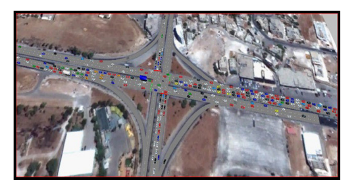
Fig. 3 VISSIM Simulation for the Existing Conventional Intersection

intersection. The Superstreet intersection was designed to match the configuration shown in Fig. 1. Only one "four-phase" signal was required for the existing conventional intersection model, while four "two-phase" signals had to be modelled on the proposed Superstreet unconventional model. Two were placed at the main intersection and two were placed at the U-turns. Fig. 3 and Fig. 4 show snapshots of the VISSIM simulation for the existing conventional and the proposed Superstreet unconventional intersection designs respectively.