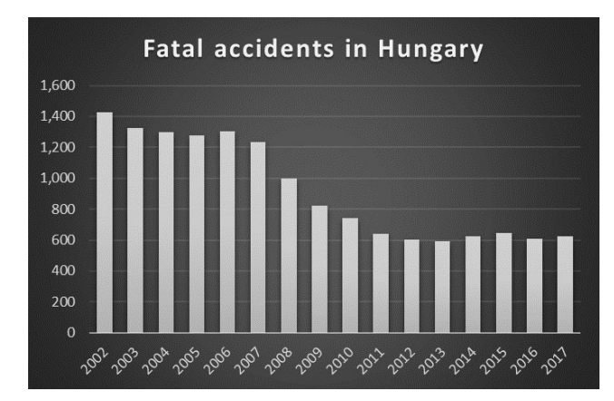
Fig. 3 Fatal accidents in Hungary between 2002 and 2017

Regression equations in the scientific literature attempt to predict the number of accidents per year and particularly significant employed variables include the Average Daily Traffic (ADT) (Abdel-Aty and Radwan, 2000), paved roadway length (Miaou, 1994), population (Young et al., 1997), number of registered vehicles (Lord et al., 2005) and GDP (Bishai et al., 2006), speed, geometric road parameters (Sipos, 2017), etc.