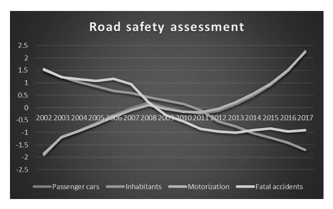
Fig. 4 Road safety assessment between 2002 and 2017

The collected data of the number of accidents and related factors covered a period of 15 years from 2002 to 2017 and related to the national road network. The data were provided by the Hungarian Central Statistical Office (Table 1).