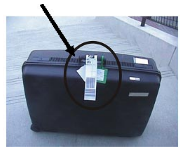
Fig. 2. Today's Baggage barcode solution

30 Per. Pol. Transp. Eng. Katalin Emese Bite