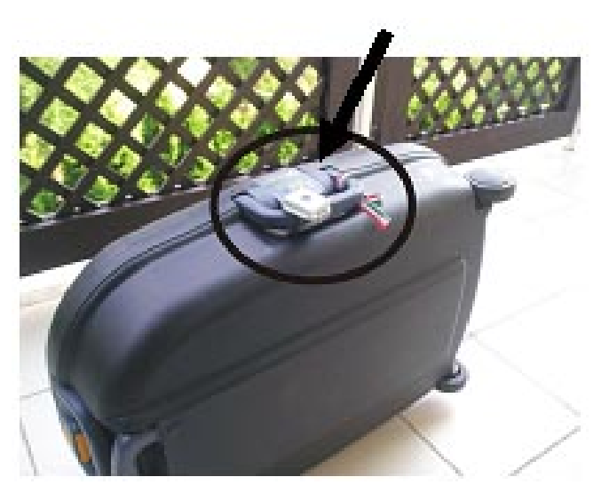
Fig. 3. . RFID implemented into a bracelet