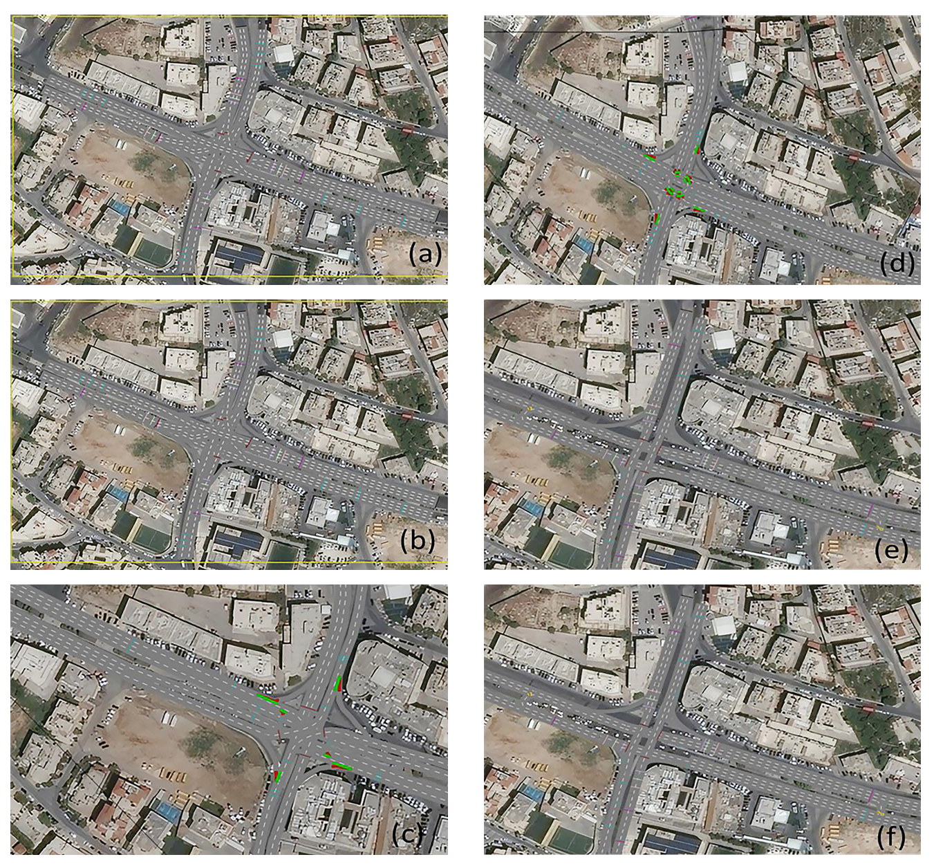
Fig. 4 Proposed alternatives: (a) current status, (b) alternative 1, (c) alternative 2, (d) alternative 3, (e) alternative 4, and (f) alternative 5