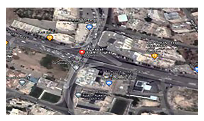
Fig. 3 Aerial view of the selected site

The Al-Assaf intersection (31°59'45.0"N 35°51'34.8"E) is a four-leg intersection. It consists of four crossing arterial roads, Wasfi Al-Tal (East and West), Al-Muhammadiyah Street (North) and Mirza Wasfi (South), as shown in Fig. 4. All these major roads are divided into four lanes with a width of 3.4 meters along the length of the road.