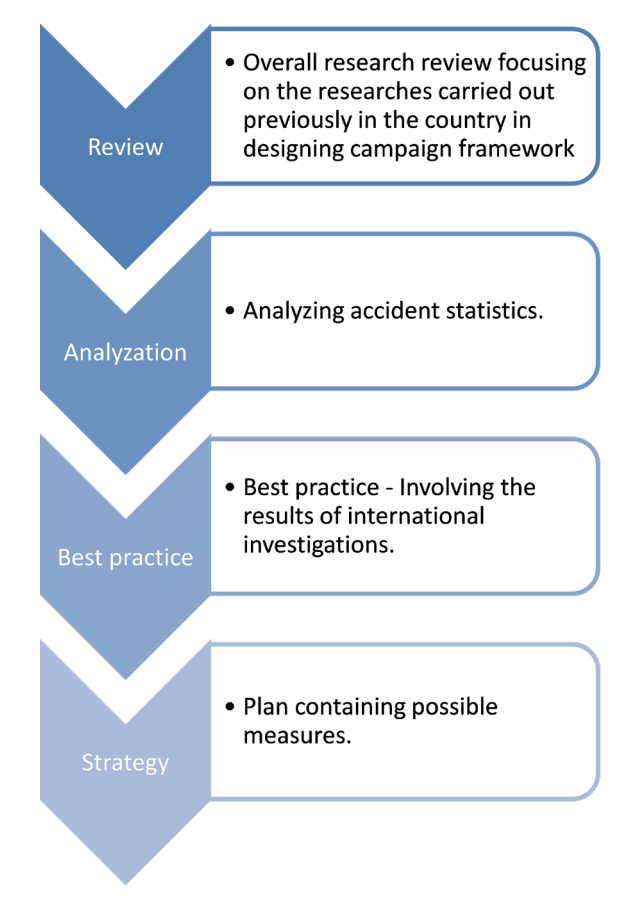
Fig. 1 preparation of campaign plan

In the first step it is crucial to provide an overall research review focusing on the researches carried out previously in the country in designing campaign framework. Beside this the review of international literature of traffic, and the laws may help in identifying the problematic areas. It is also important to have a clear picture from demographic trends processing in the given country (e.g. problem of aging societies or the effect off of the level of education on transport culture) (Elvik, 1997).